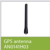
GPS antenna AN0141H03