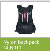
Nylon backpack NCN010