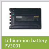
Lithium-ion battery PV3001