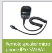
Remote speaker microphone IP67 SM18A1